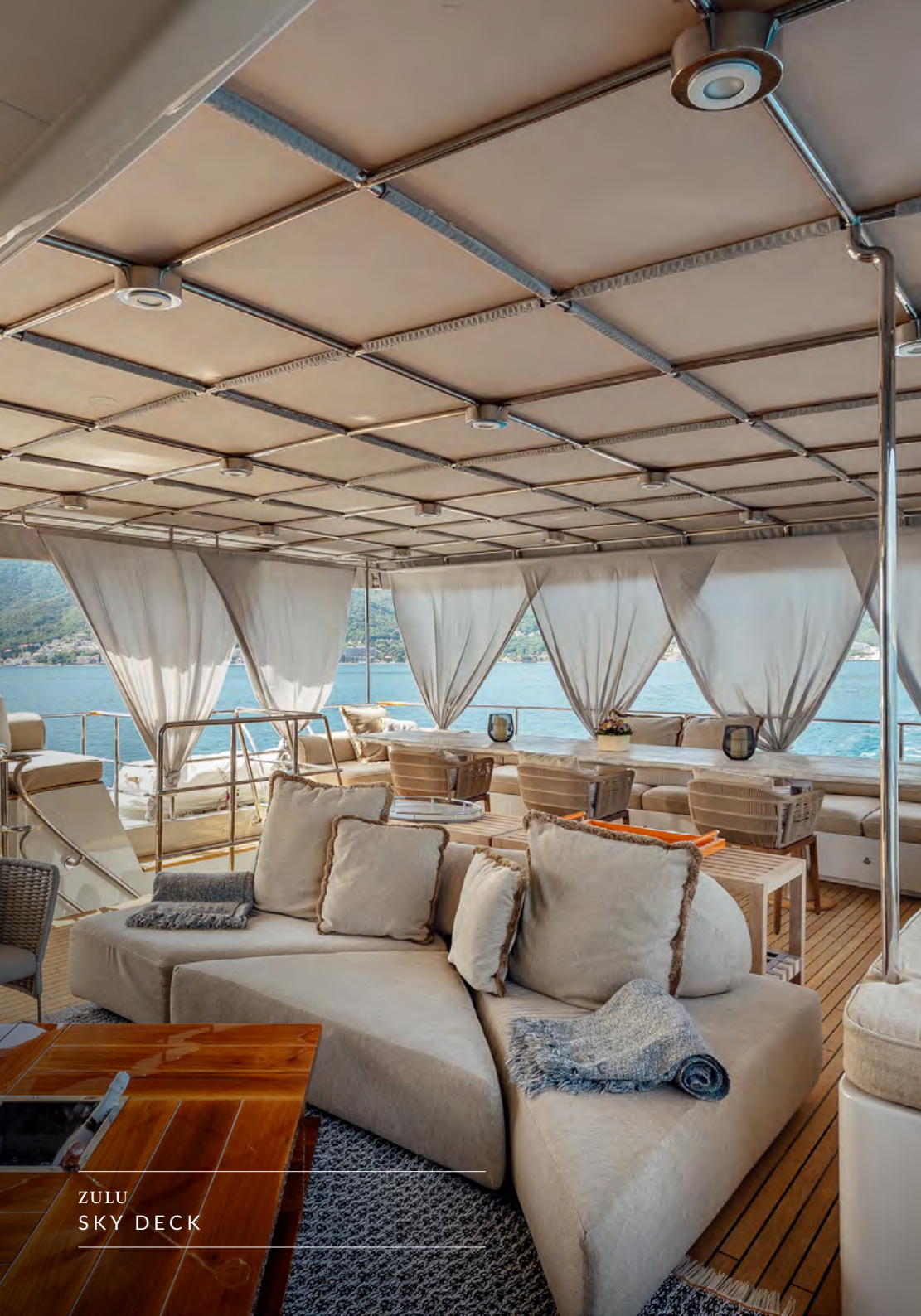
ZULU SKY DECK