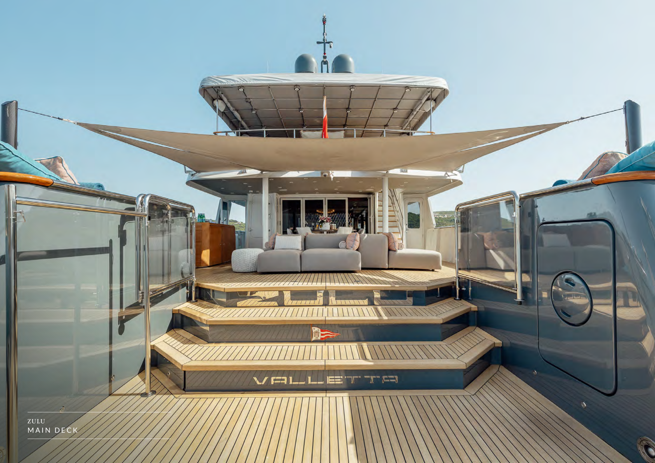
ZULU MAIN DECK