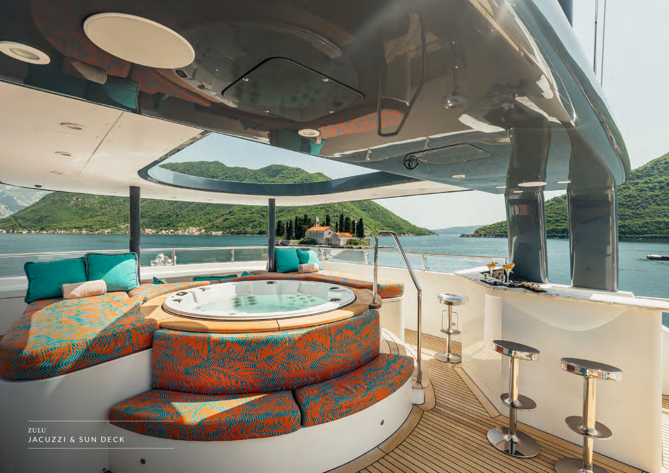
ZULU JACUZZI & SUN DECK