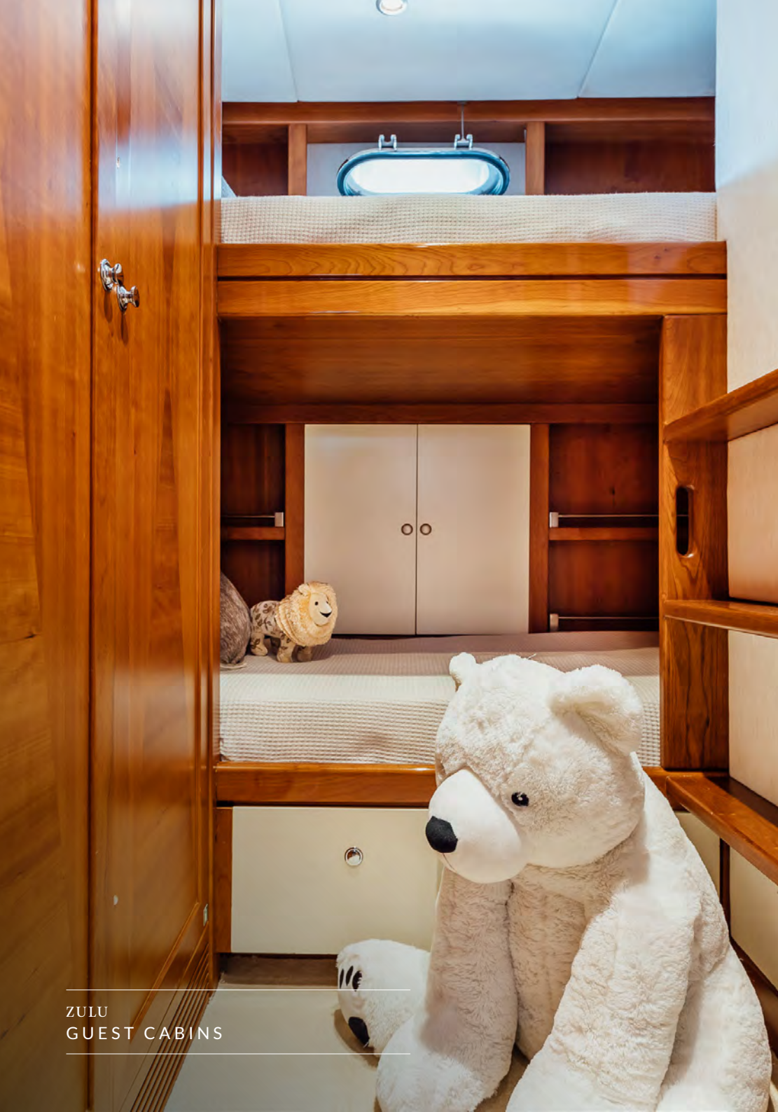
ZULU GUEST CABINS