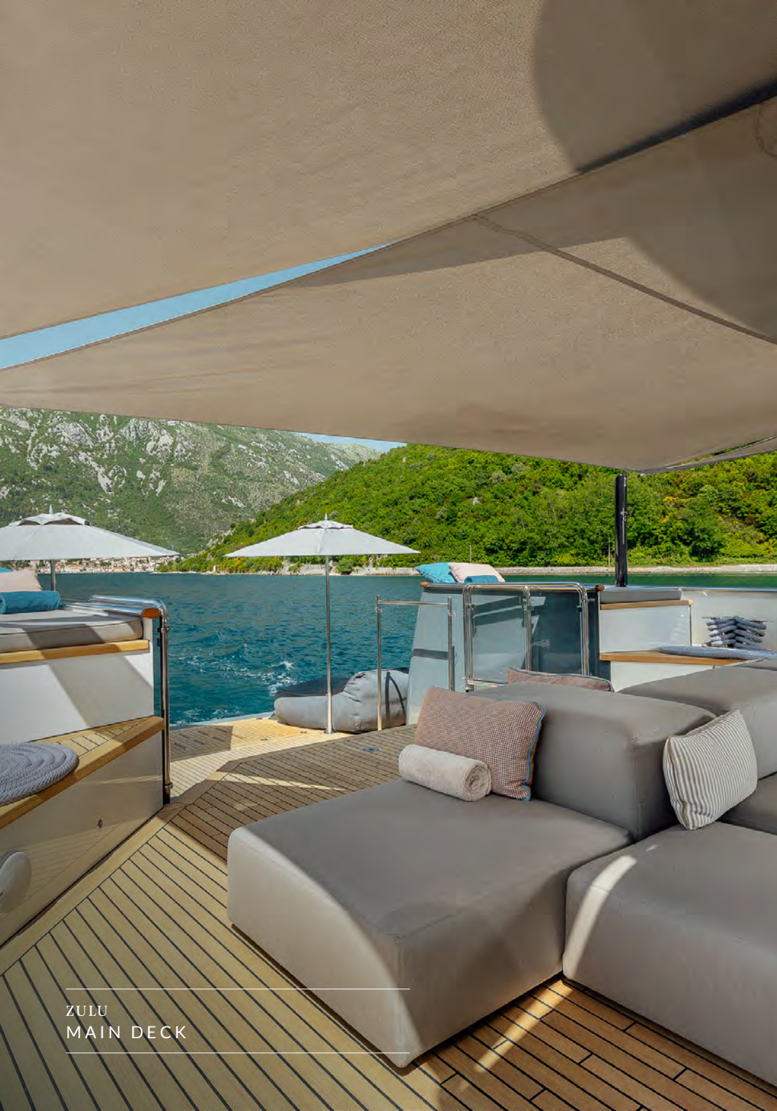
ZULU MAIN DECK