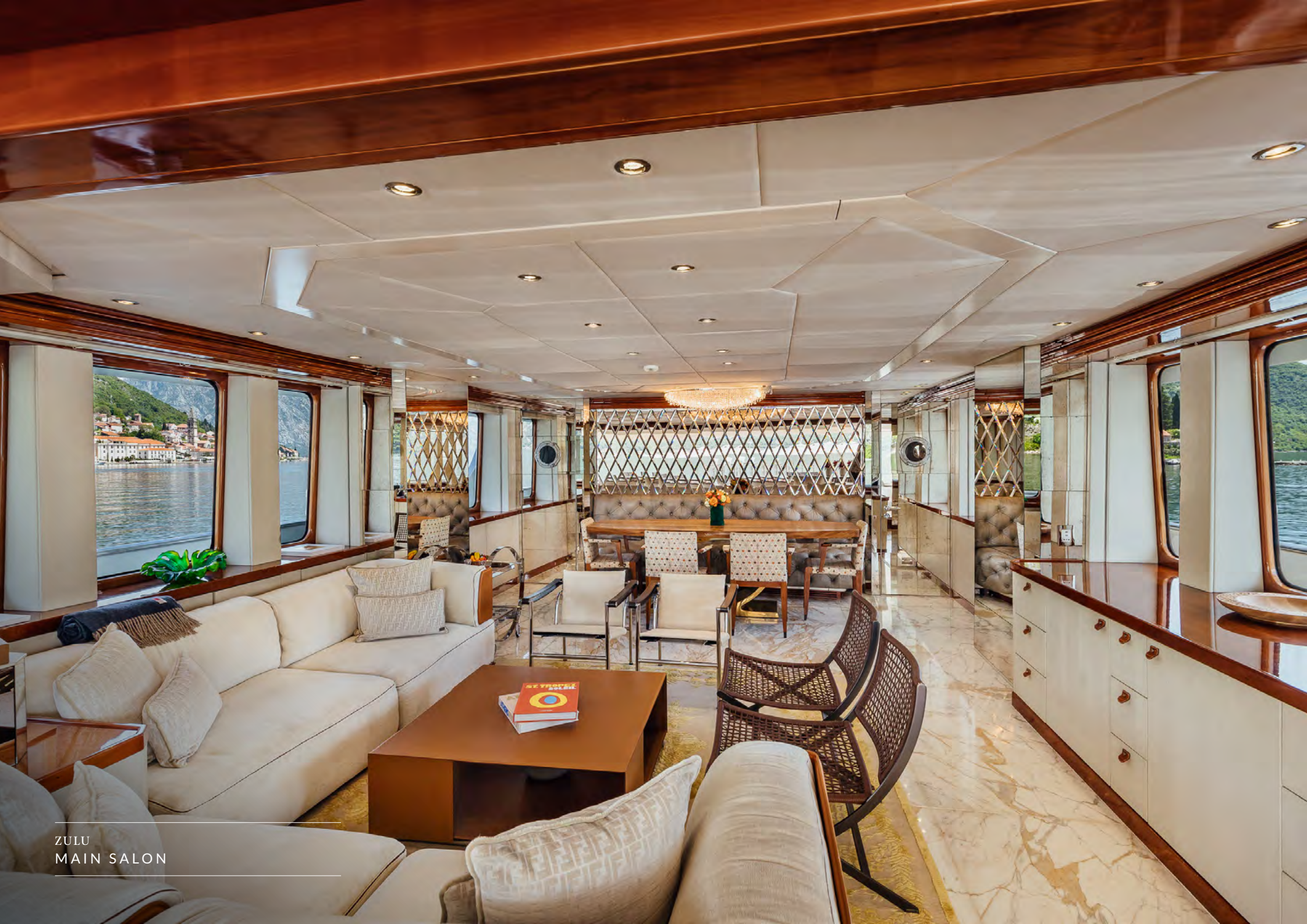
ZULU MAIN SALON