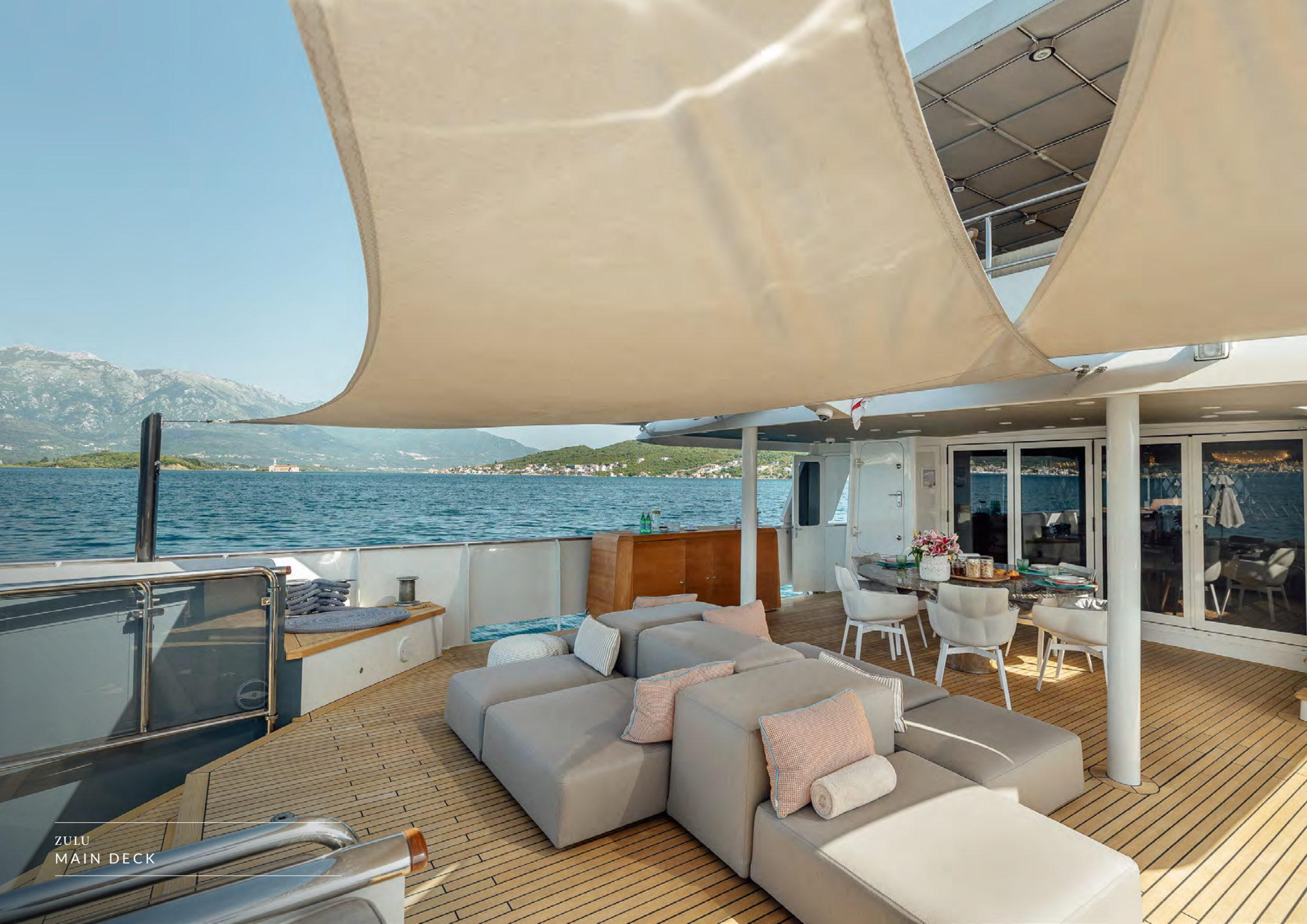
ZULU MAIN DECK