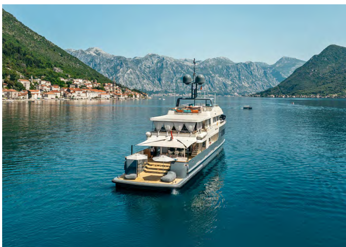
ZULU EXTERIOR PROFILE