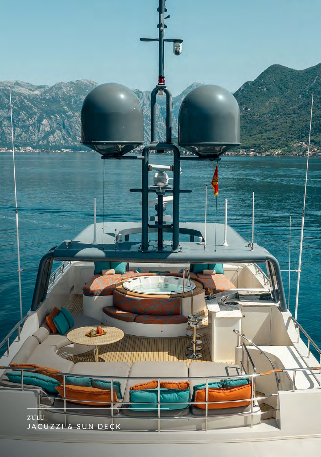
ZULU JACUZZI & SUN DECK