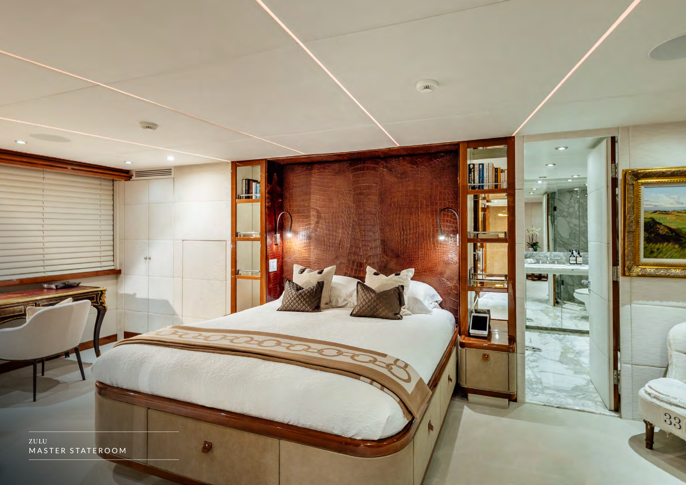
ZULU MASTER STATEROOM