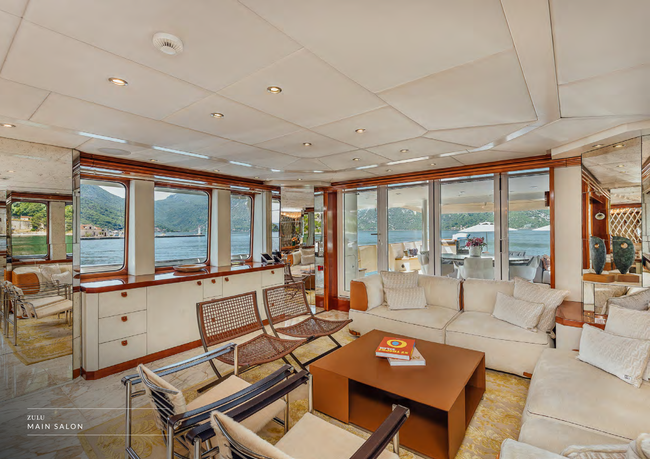
ZULU MAIN SALON