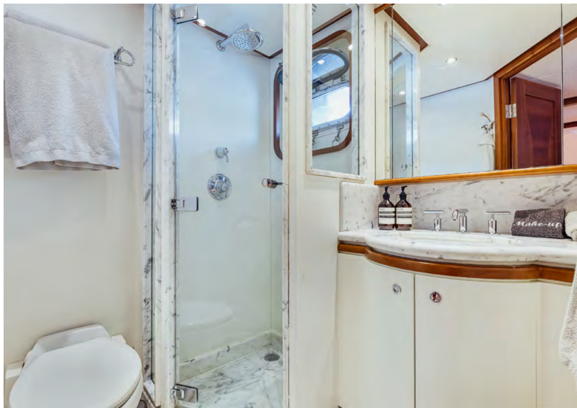
ZULU GUEST CABINS