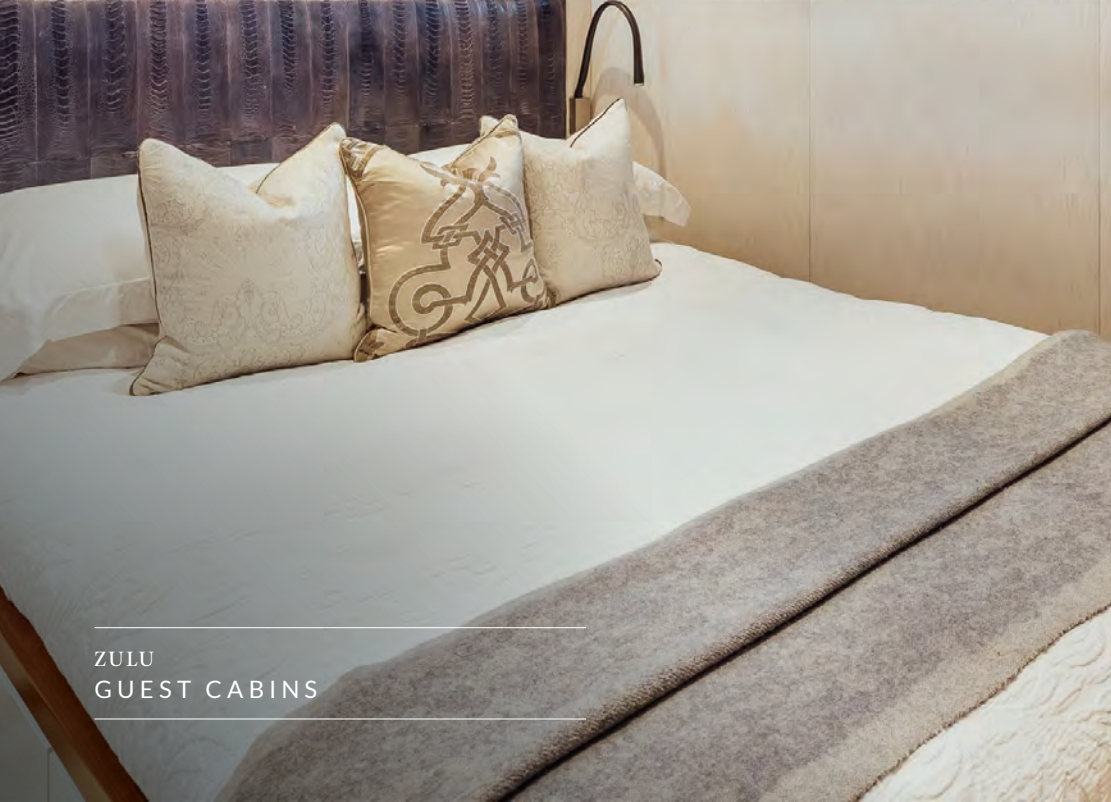
ZULU GUEST CABINS