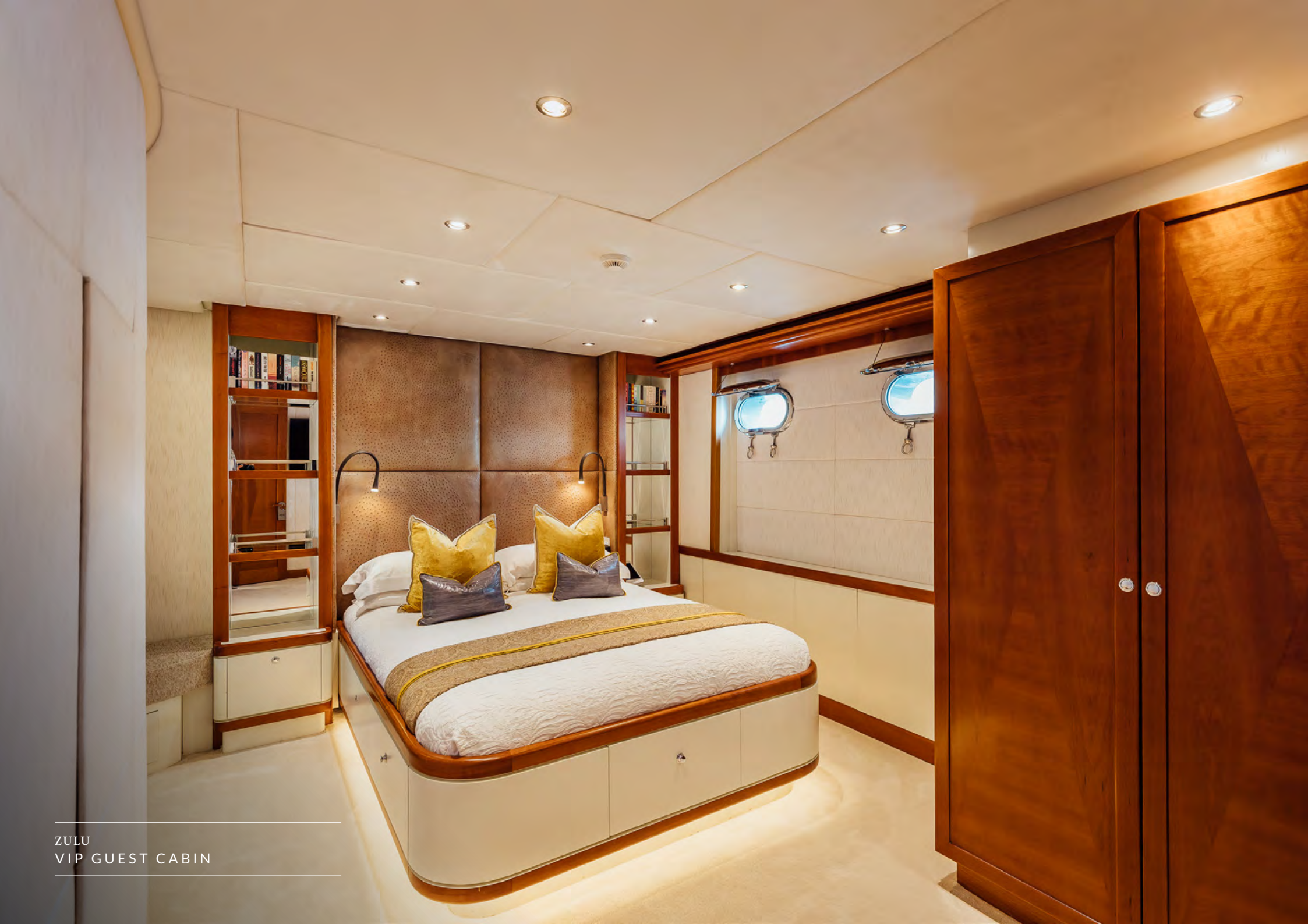
ZULU VIP GUEST CABIN