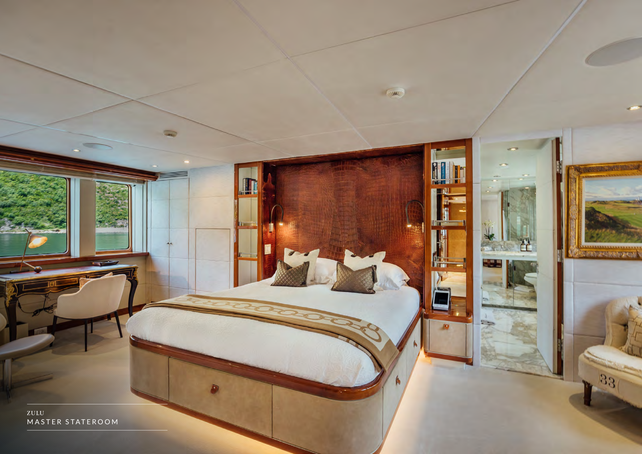
ZULU MASTER STATEROOM