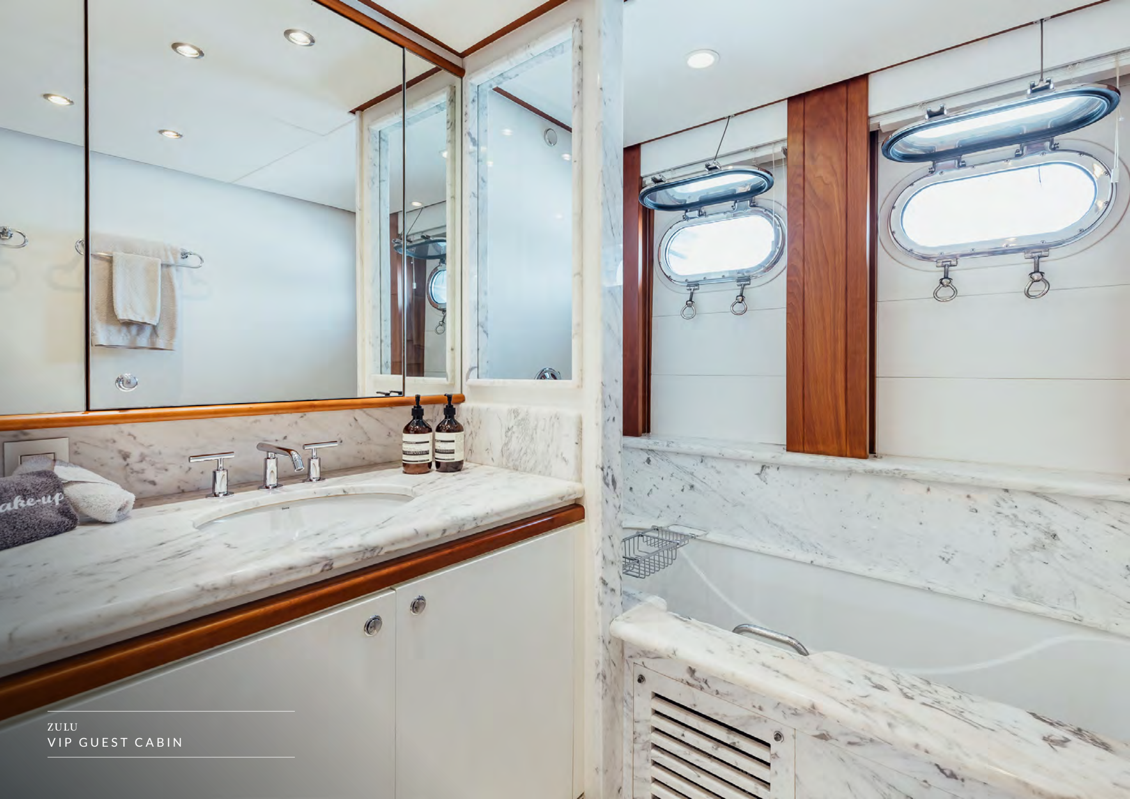
ZULU VIP GUEST CABIN