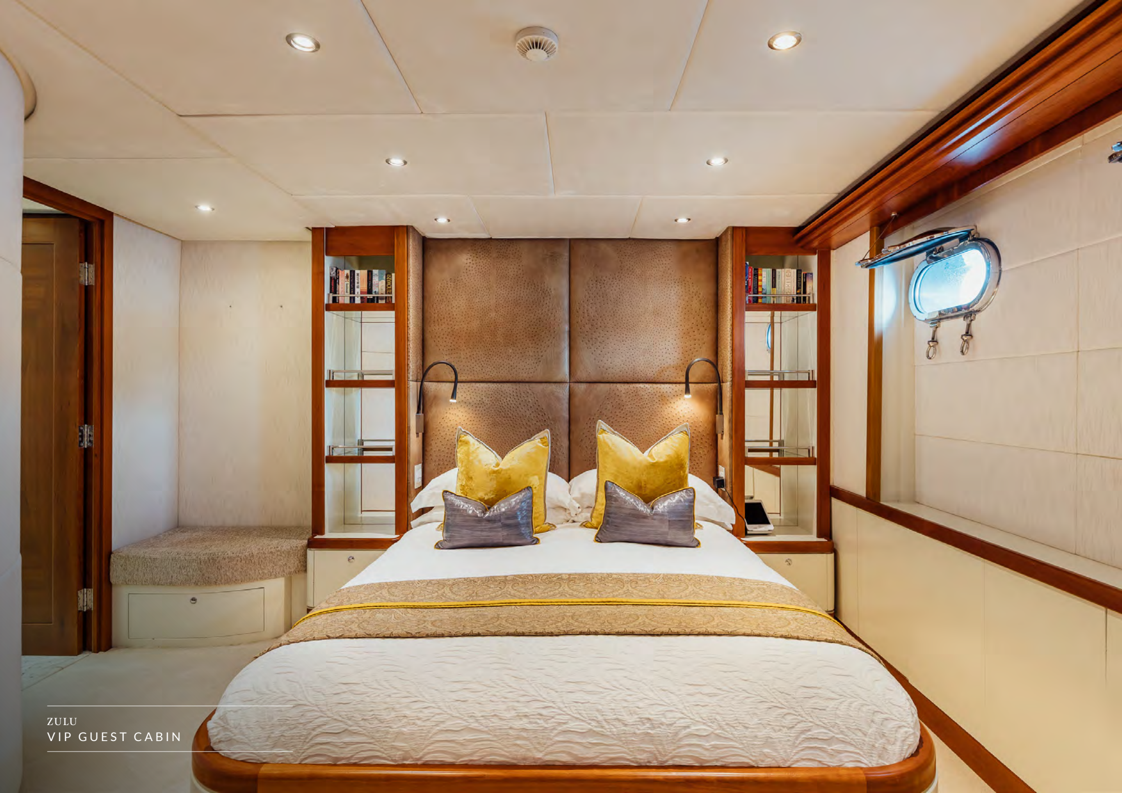
ZULU VIP GUEST CABIN