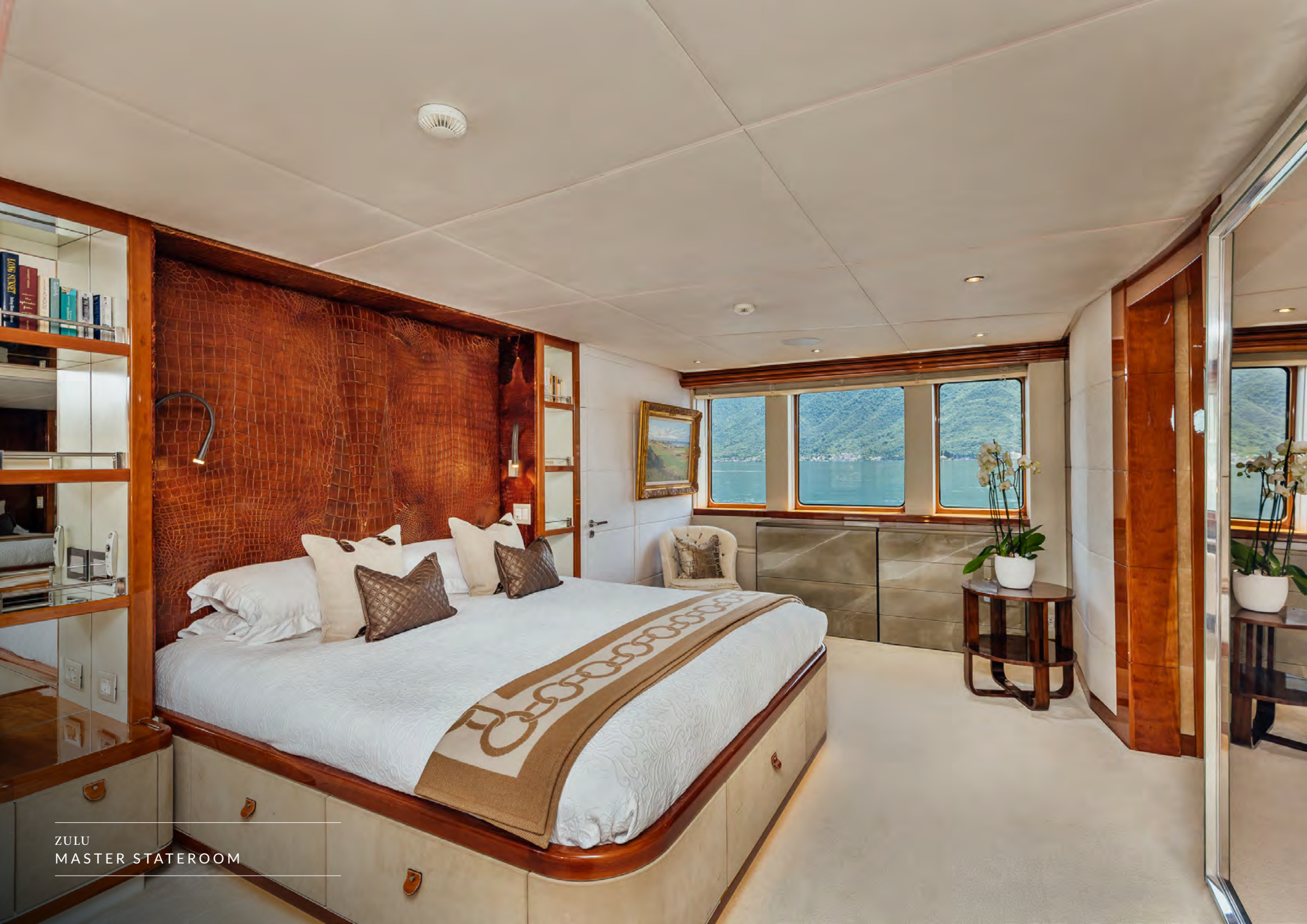
ZULU MASTER STATEROOM