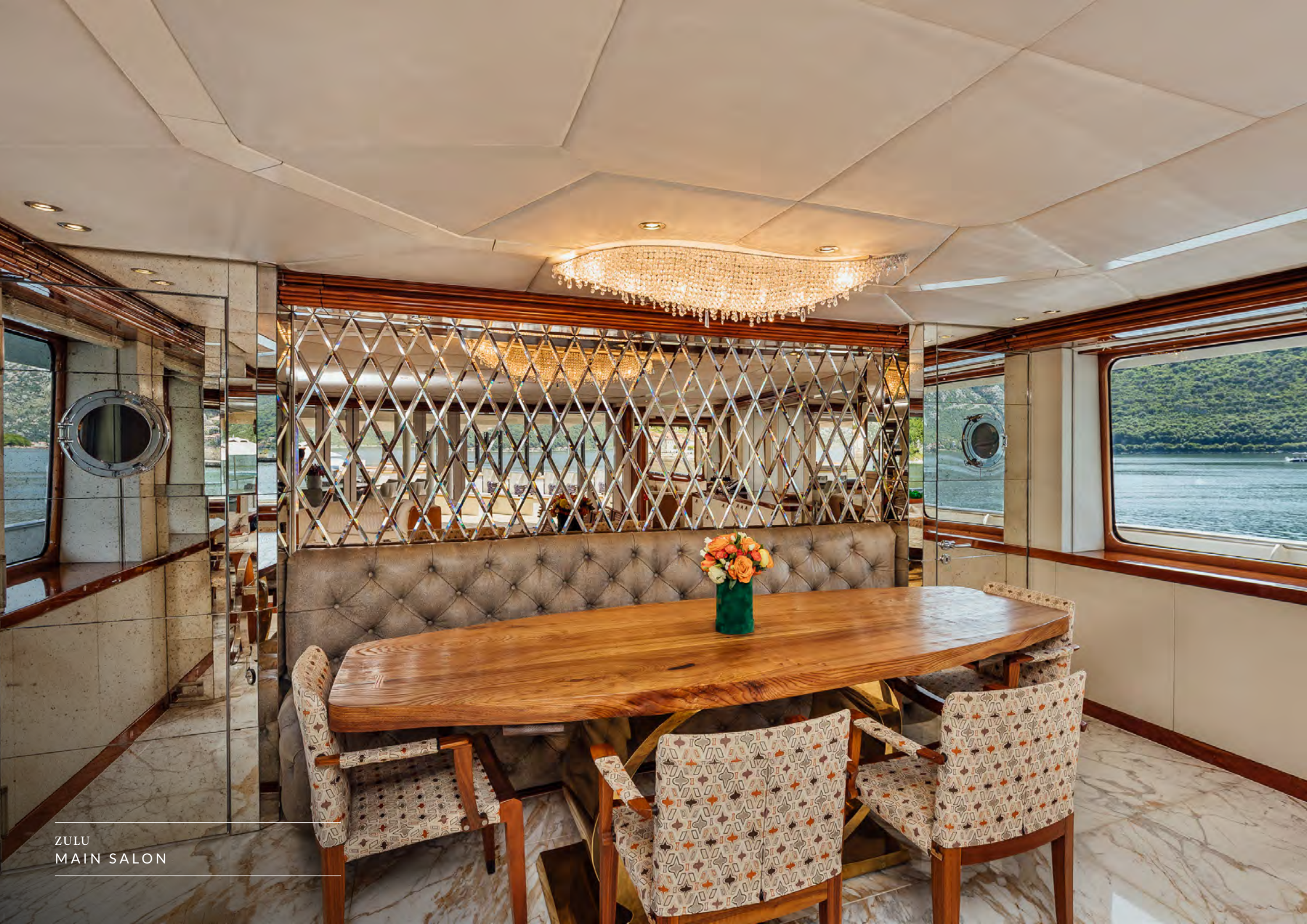
ZULU MAIN SALON