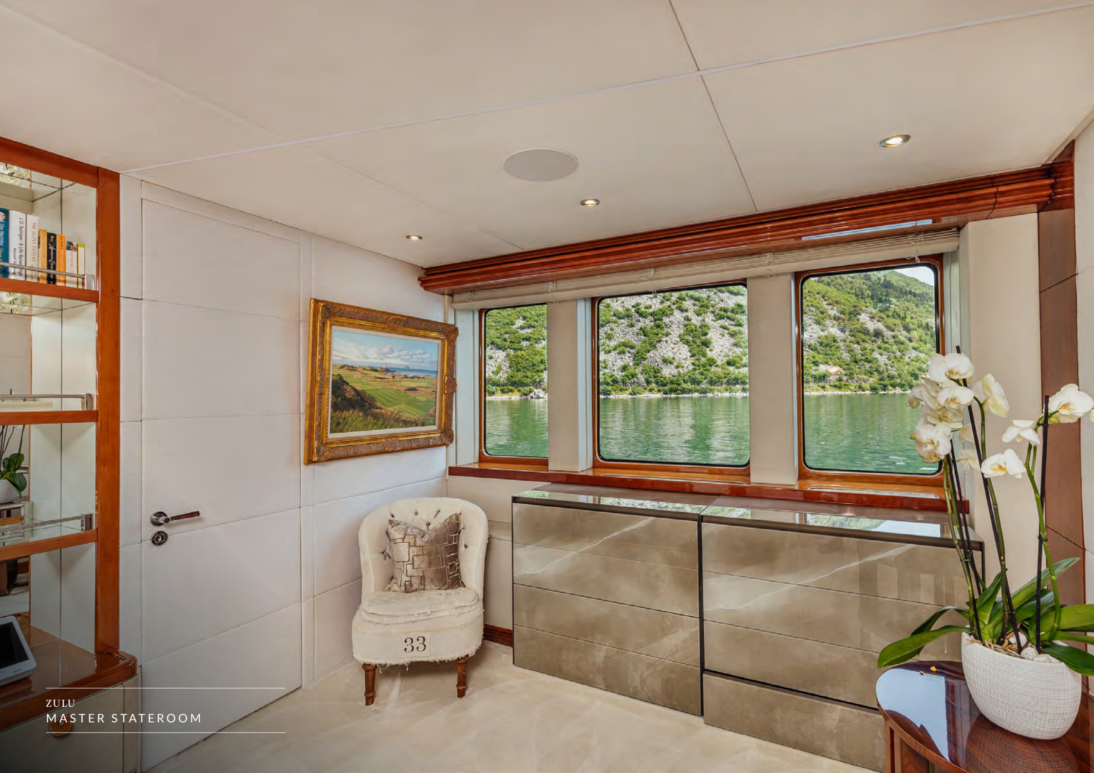
ZULU MASTER STATEROOM