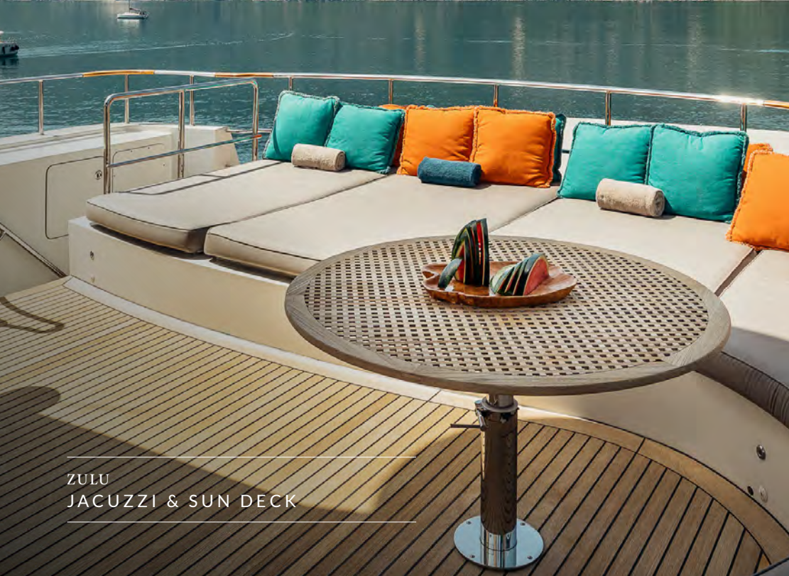
ZULU JACUZZI & SUN DECK