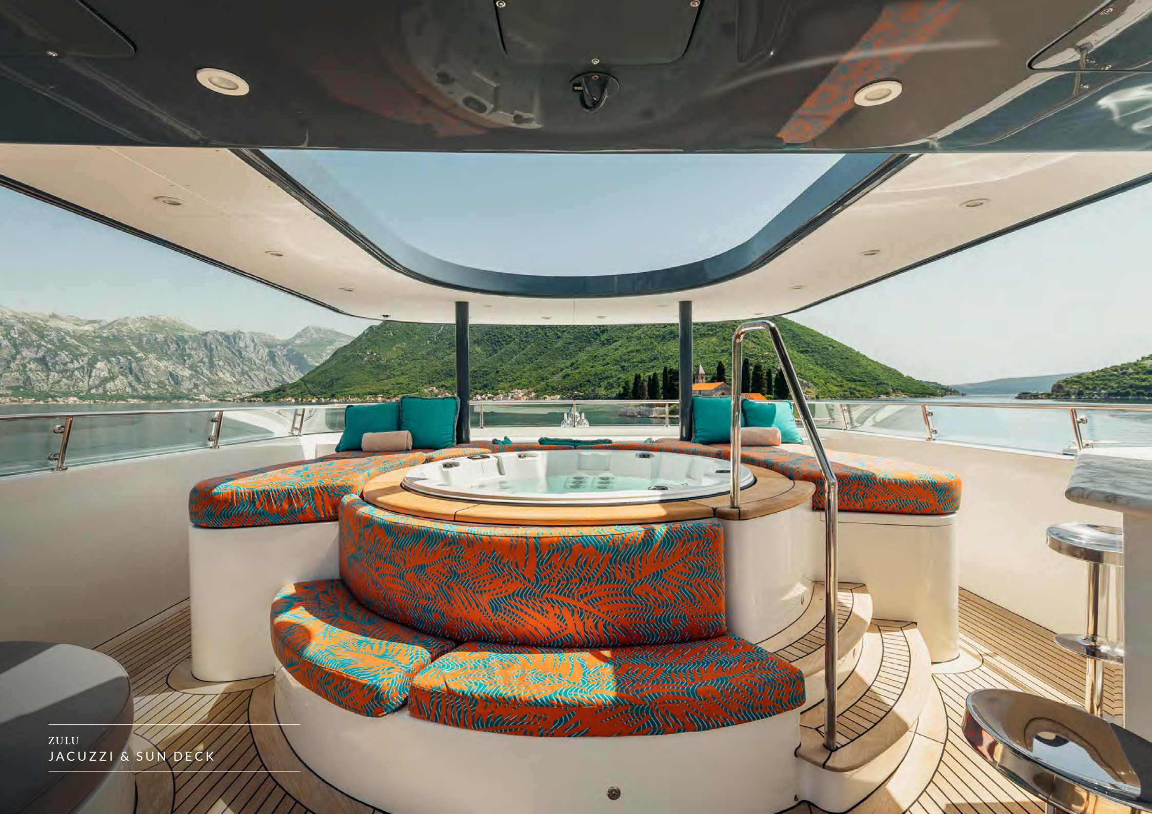
ZULU JACUZZI & SUN DECK