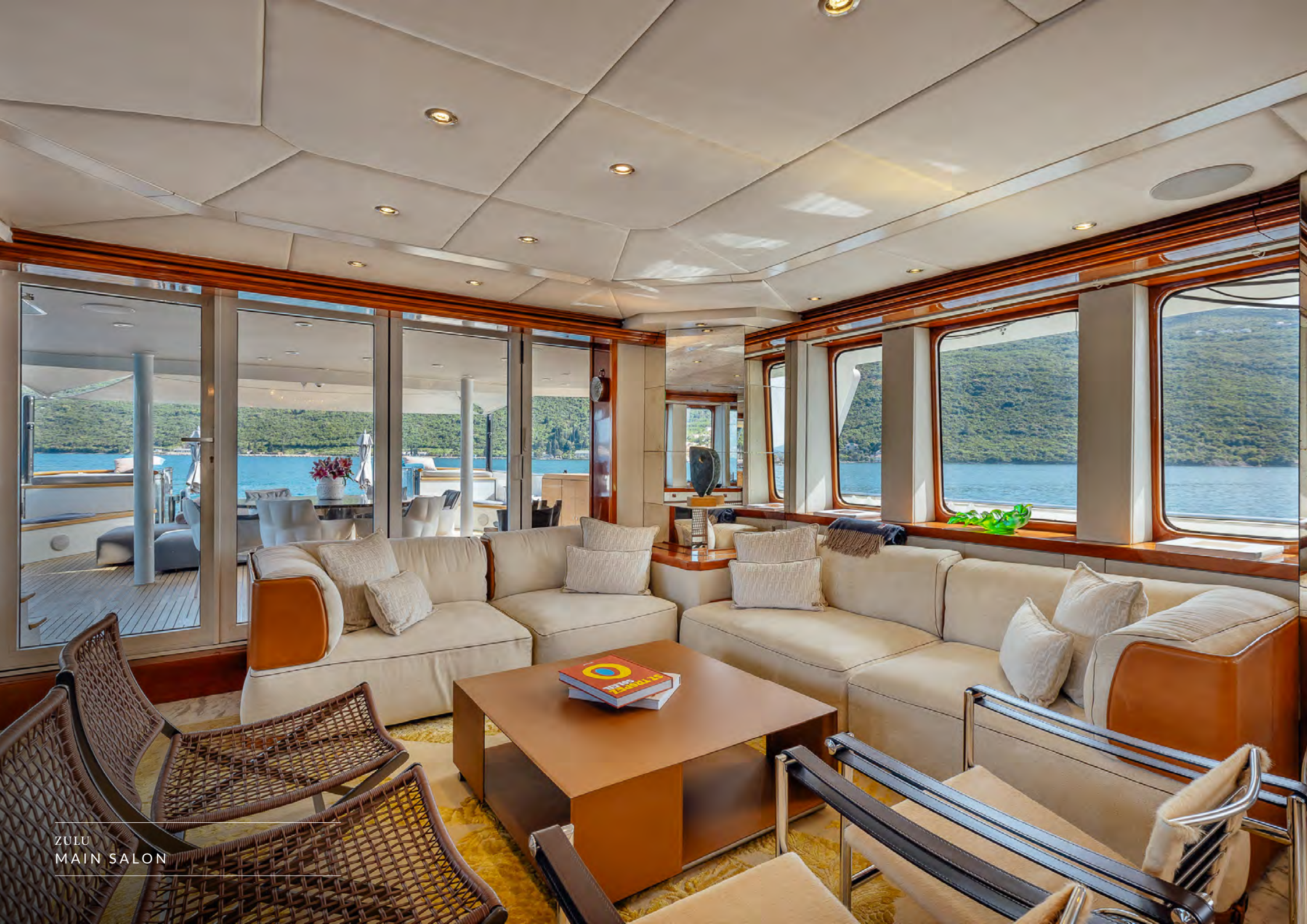
ZULU MAIN SALON