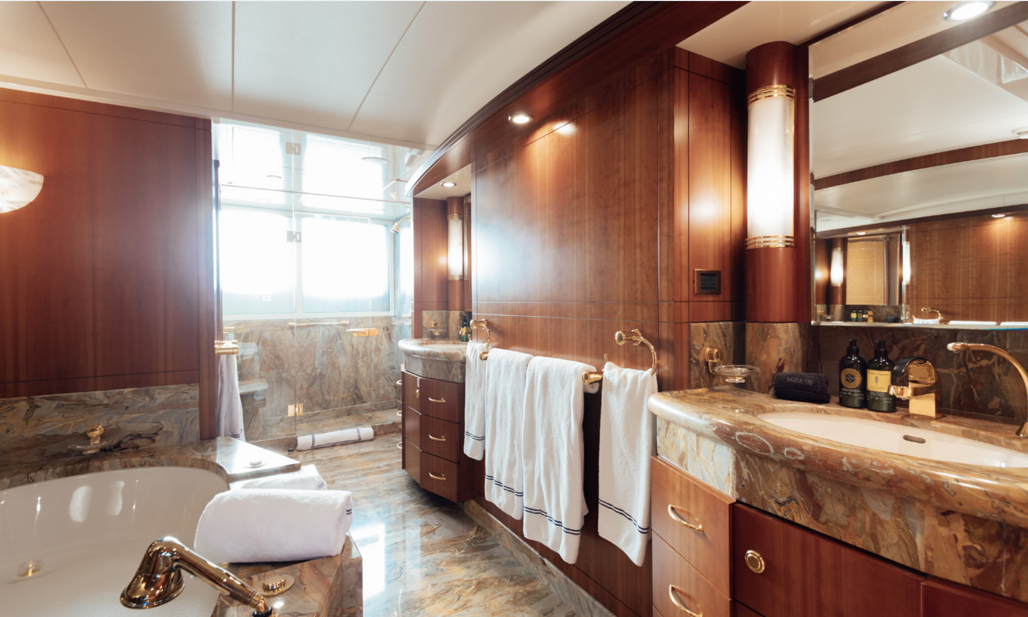
Master Stateroom Bathroom