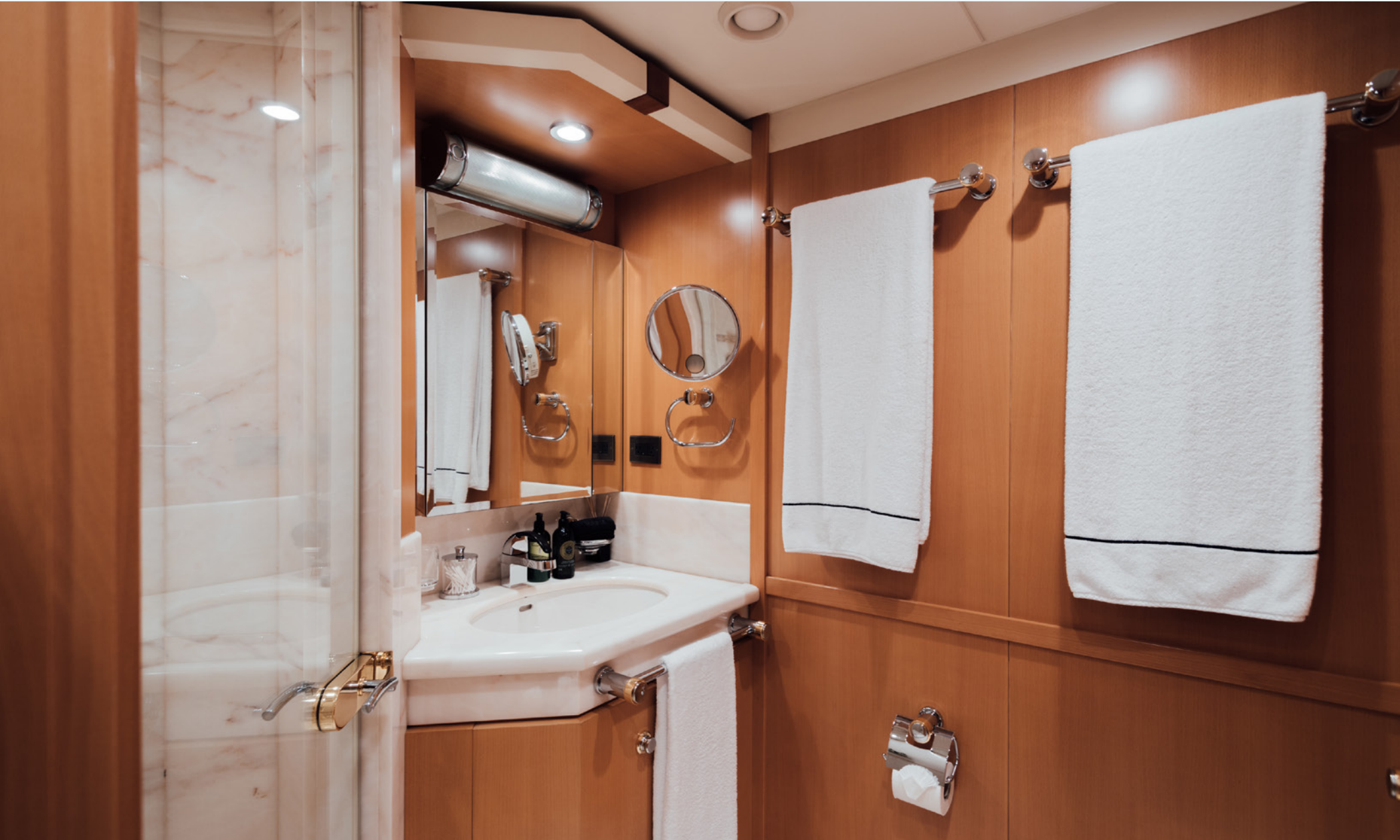
Guest Cabin Bathroom