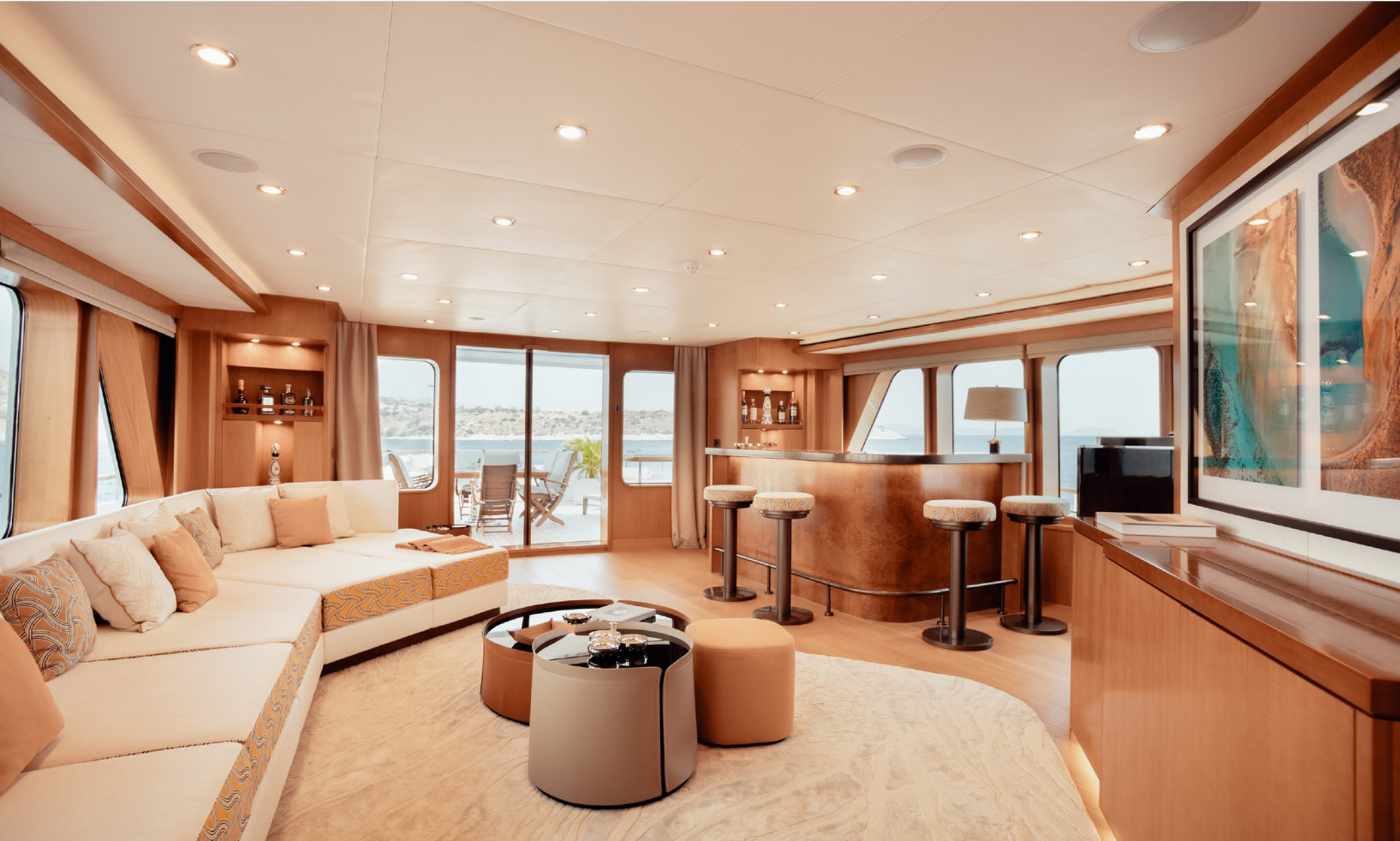
Bridge Deck Salon