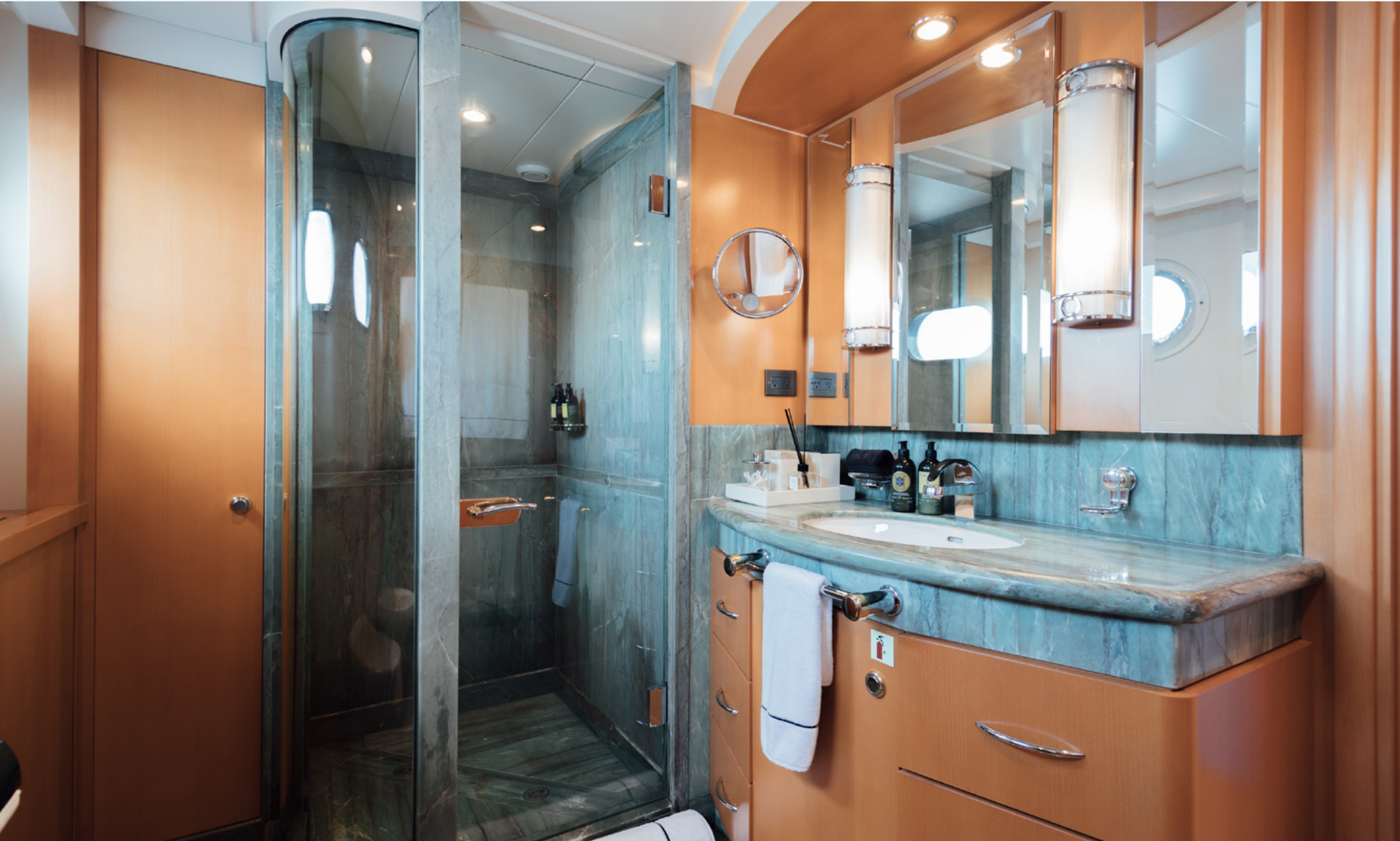
Guest Cabin Bathroom