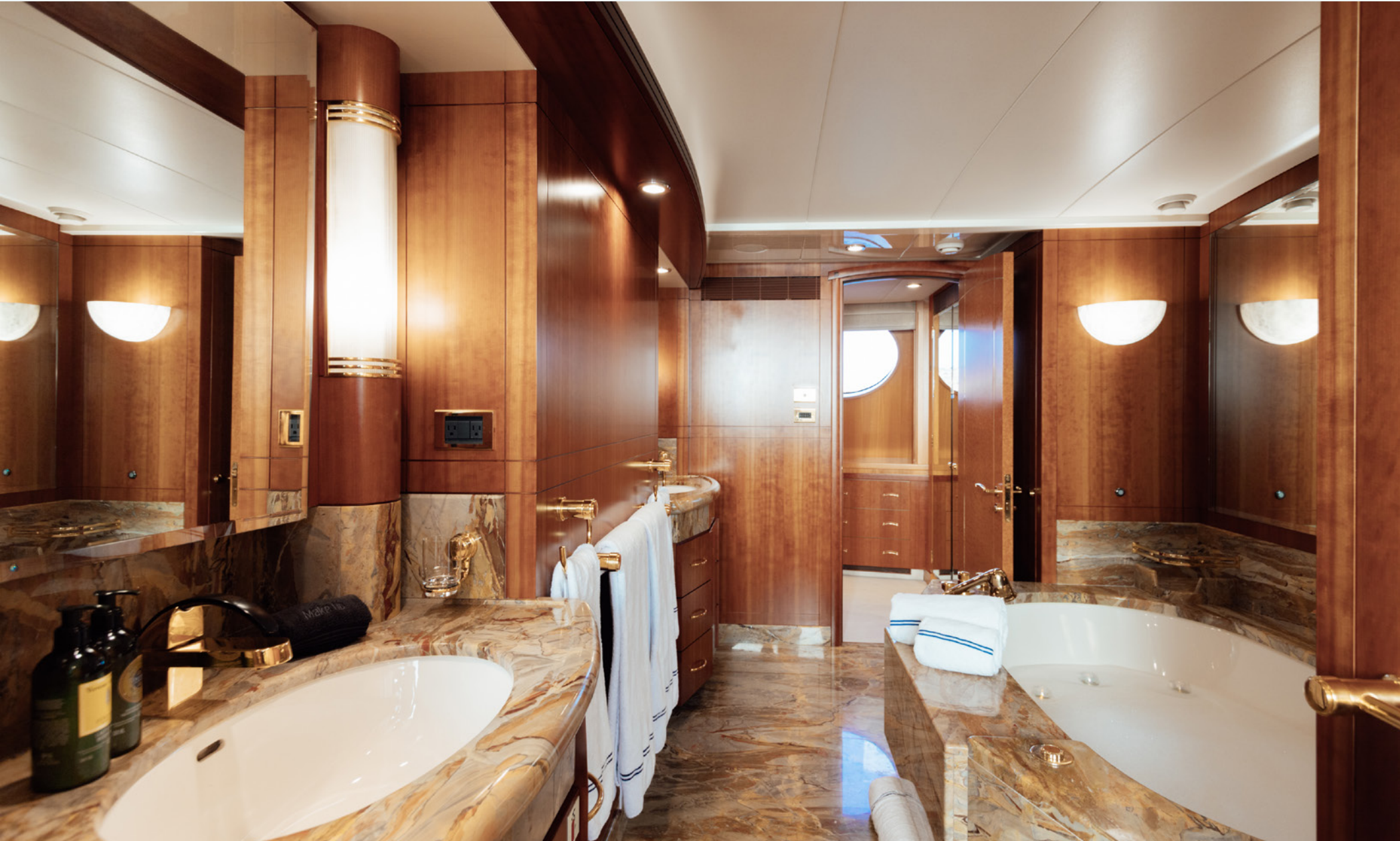
Master Stateroom Bathroom