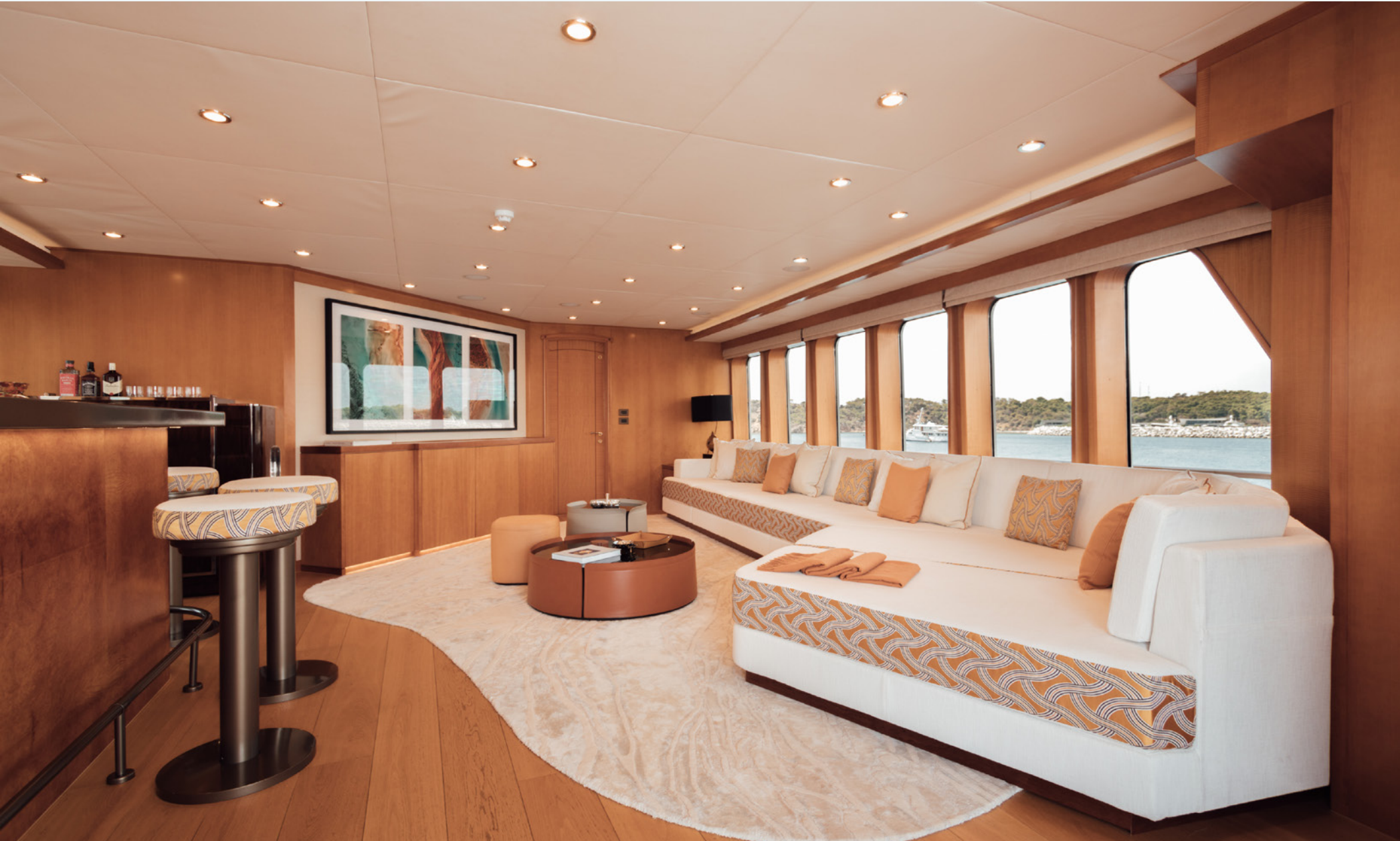
Bridge Deck Salon